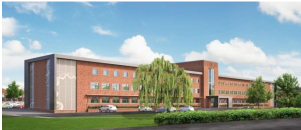
Joseph Banks Laboratories, please follow the car park behind this building

Please take care and drive very slowly in front of the JBL building shown below (particularly in front of the reception area). This is due to the ground having sharp drainage dips at the bottom of the slopes.